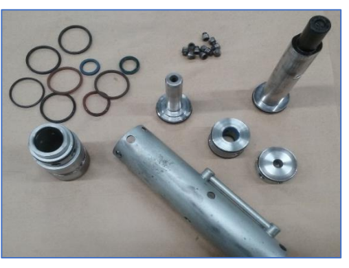
Centerline cylinders with old seals