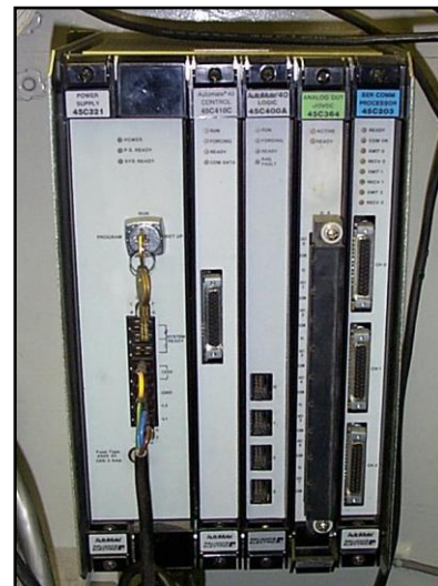
AutoMate 30 & 40