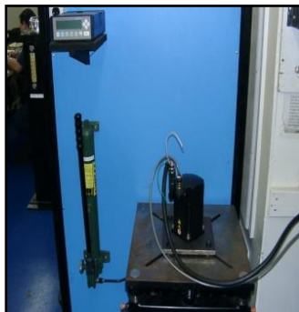
Hydraulic Load Stand