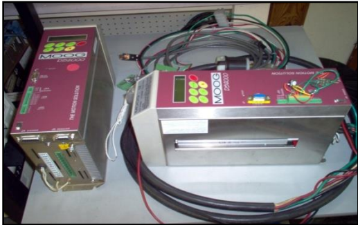
DS2000 Moog Drive

Our K+S Facilities are able to repair and fully load test the T200, T164, and DS2000 series of Moog servo controllers and power supplies. Each controller is carefully evaluated, the necessary repairs and preventative maintenance is then performed. The unit is then fully load tested on the hydraulic load stand to ensure that the controller can source the maximum current. Moog servo controllers with the built in power supply option are tested on the mechanical load stand to fully diagnose & test the internal and external regenerative functions of the drive. All ports on these Moog servo controllers are fully function tested to guarantee a quality repair every time.