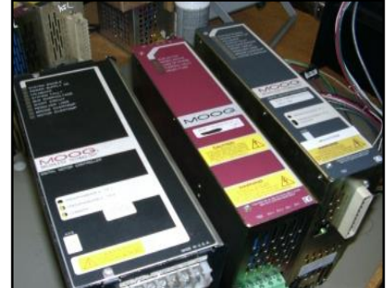
T164 Series Servo Drives & Power Supply