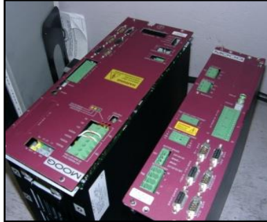
Moog T200 Series Servo Drives