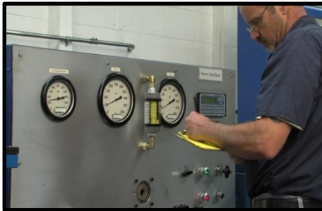
Dedicated Run – In Stand