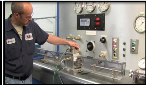
Dynamic Servo Testing