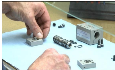
Clean Air Assembly Benches