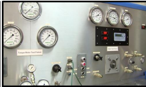
Torque Motor & Static Servo Testing