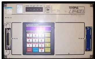
PC1 TPC-2060 with Integrated I/O Monitor Panel