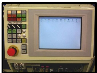
IDEC Monitor Touchscreen Control Panel