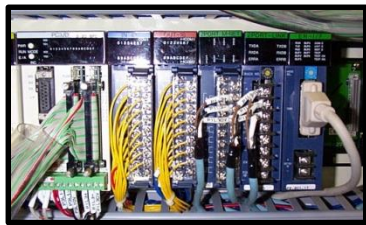
(Expanded view of PC3JD)