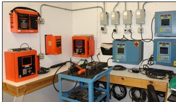
Cooper Test Area