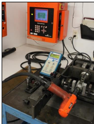
Cooper Tool Testing