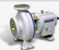
Fluid Process Pumps