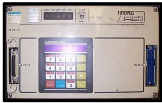
PC1 TPC-2060 with Integrated I/O Monitor Panel