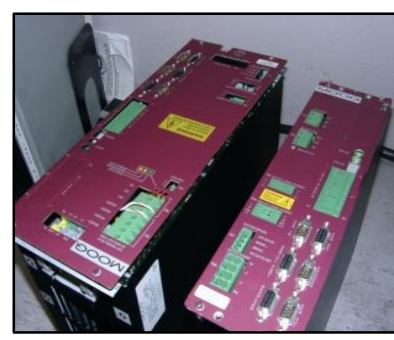
Moog T200 Series Servo Drives