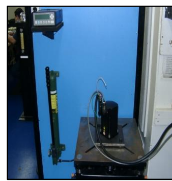
Hydraulic Load Stand

Our K+S Facilities are able to repair and fully load test the T200, T164, and DS2000 series of Moog servo controllers and power supplies. Each controller is carefully evaluated, the necessary repairs and preventative maintenance is then performed. The unit is then fully load tested on the hydraulic load stand to ensure that the controller can source the maximum current. Moog servo controllers with the built in power supply option are tested on the mechanical load stand to fully diagnose & test the internal and external regenerative functions of the drive. All ports on these Moog servo controllers are fully function tested to guarantee a quality repair every time.