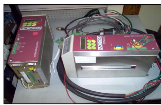
DS2000 Moog Drive