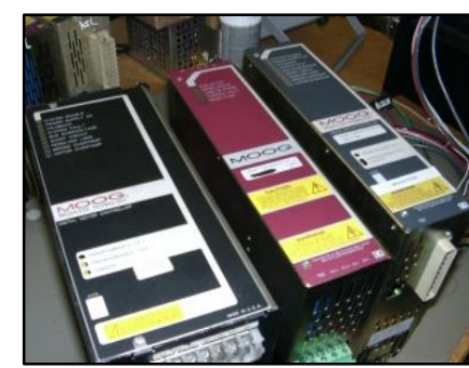
T164 Series Servo Drives & Power Supply