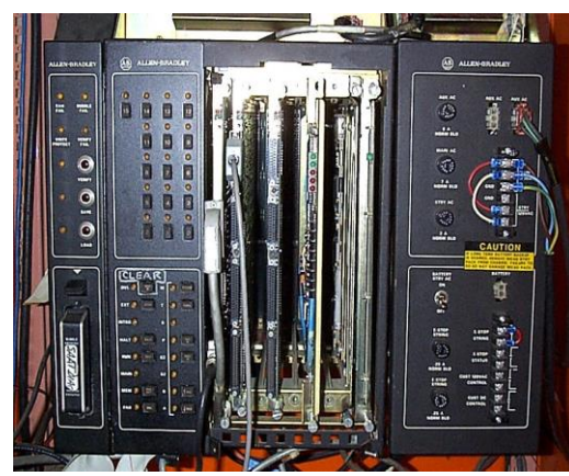
Processor Control Rack