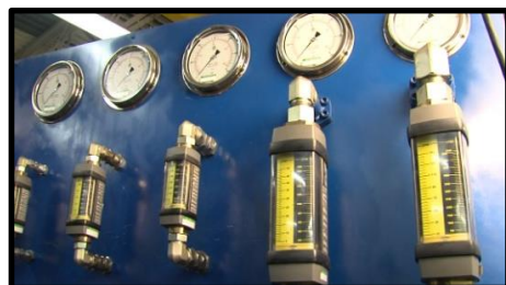
Closed Loop Testing