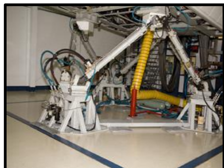
Hydraulic Motion Legs