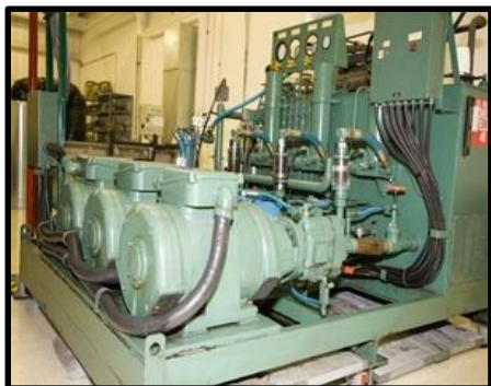
Hydraulic Power Units