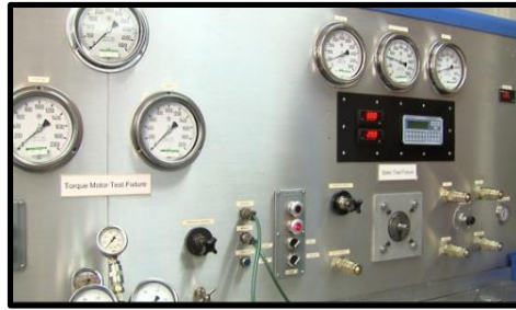
Torque Motor & Static Servo Testing