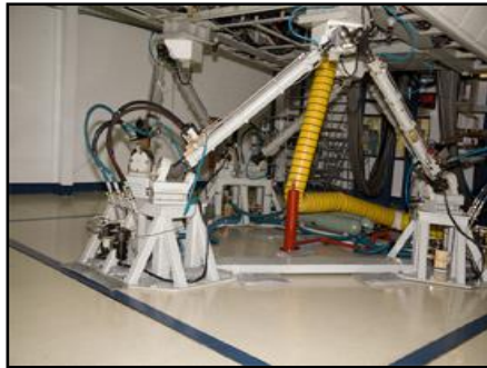
Hydraulic Motion Legs