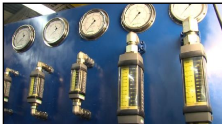
Closed Loop Testing