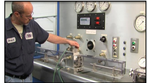
Dynamic Servo Testing