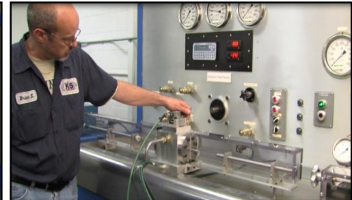
Dynamic Servo Testing