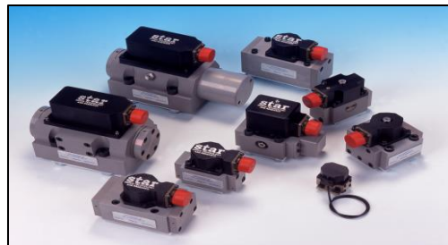
K+S is the ONLY USA Authorized Distributor of STAR Valves