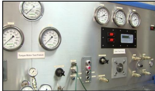
Torque Motor & Static Servo Testing