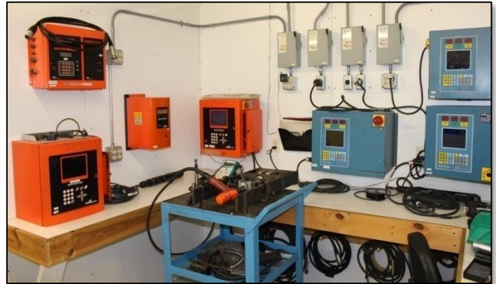
Cooper Test Area