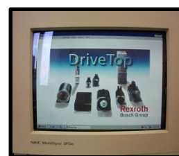
DriveTop Software running on a standard PC