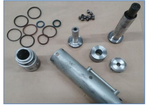
Centerline cylinders with old seals