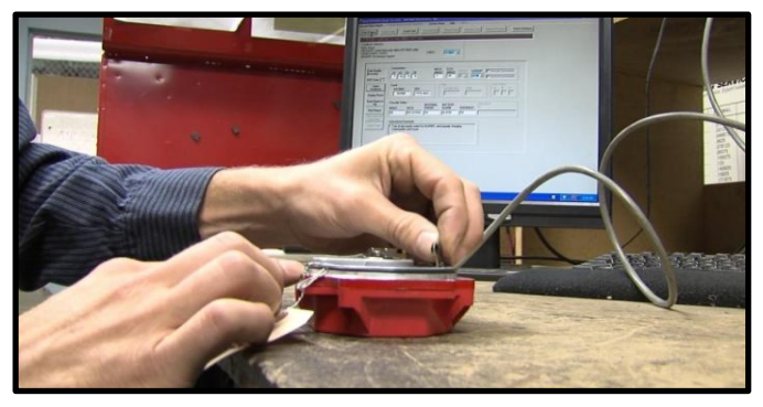
Complete Testing of Feedback Components