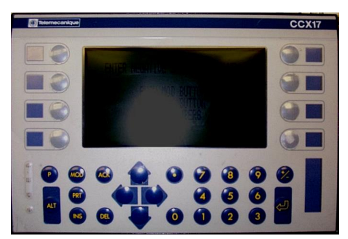
CCX 17 MAN-MACHINE INTERFACE

These panels are very common and can be found in many industrial applications where Modicon PLC equipment is used. They are commonly used with the TSX Micro and Premium systems running PL7 software.