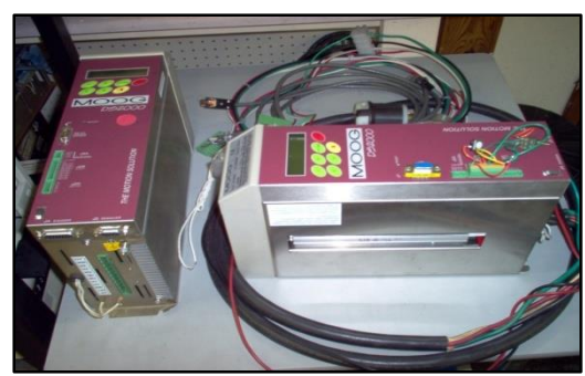
DS2000 Moog Drive