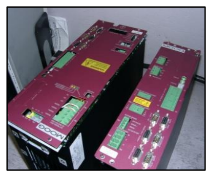
Moog T200 Series Servo Drives