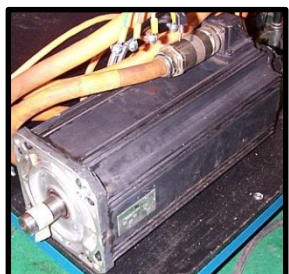
MDD Servo Motor