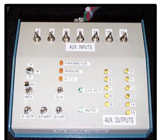
Automatic Control Panel