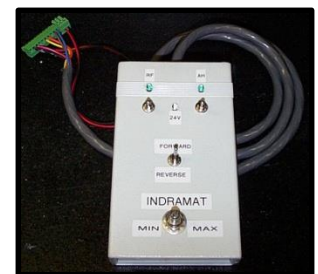
Manual Control Panel