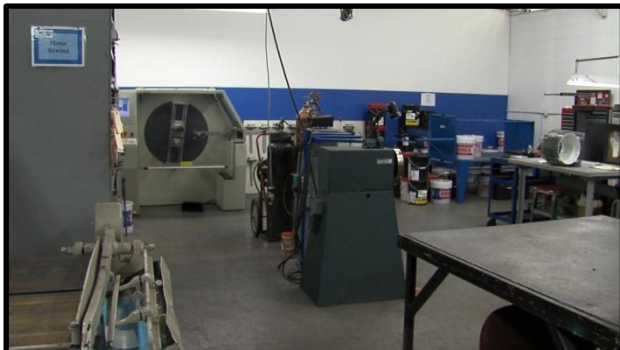
Motor Rewind Department