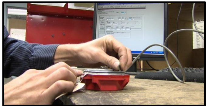
Complete Testing of Feedback Components